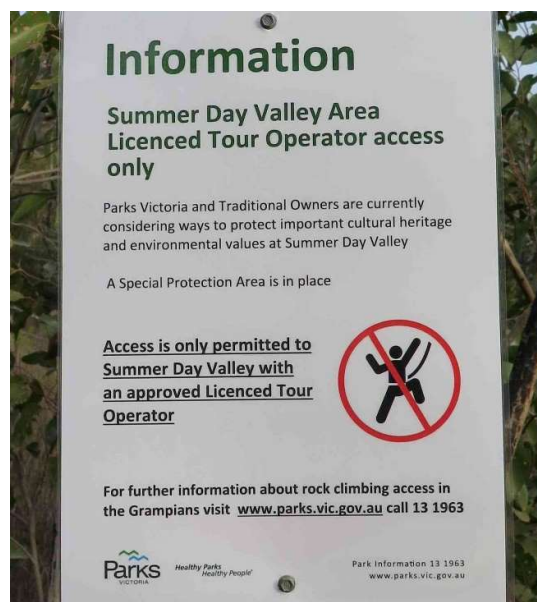
Fig 4 – Advisory Sign, No Legal Authority

We note that a regulatory sign must state the applicable Regulations. Signs such as those at Summerday Valley do not cite Regulations and hence are advisory-only with no legal authority :