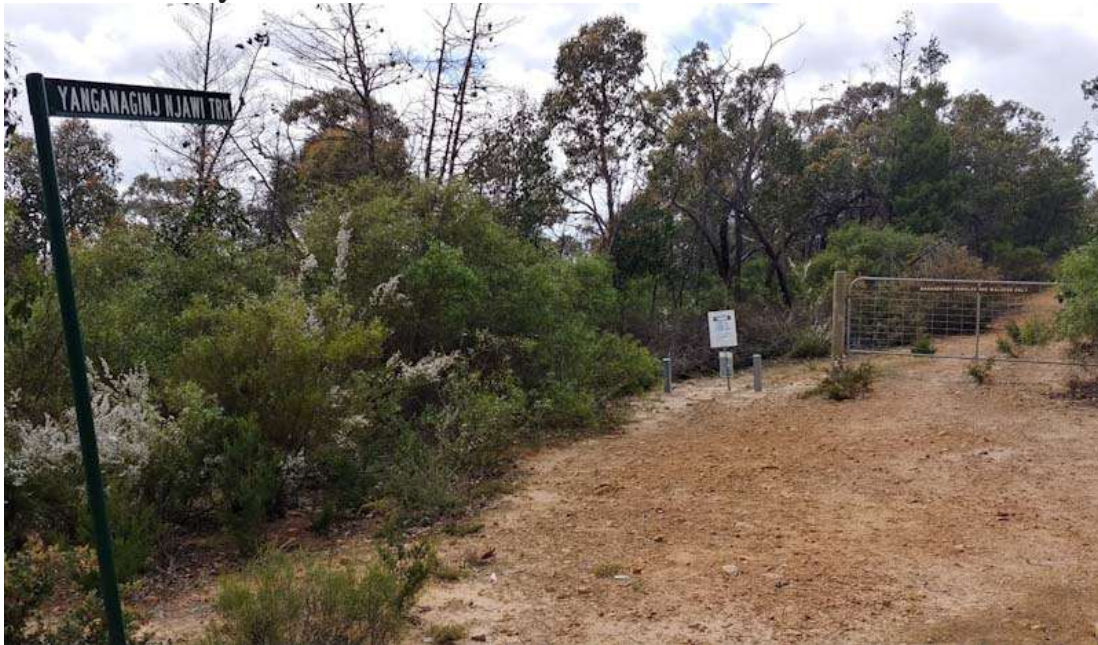
Fig 2 – Temporary regulatory sign at trail head, 3km from Gondwanaland cultural site